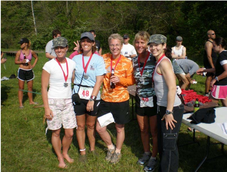
The G-I Janes after Dances with Dirt