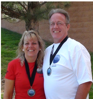
Captain and Mrs. Coyote

Coyote Kids has begun again with perfect weather for our first night. We had almost 600 kids run the first night! The registration team did a great job passing out the new bracelets, streamlining the registration process with so little paperwork now involved! We had a lot of new families as well as many families returning for another year of their favorite running program. Anyone (0-18) can join on any Thursday night before the races. You only have to run 4 of the 6 weeks to receive a small trophy. We have had one night rained out already, so we will definitely use our rain week we built in at the end of the season. The dates are always on a Thursday night at 6:15 for toddlers and 6:30 for the older kids. We will run June 28, July 5, 12, 19, and July 26. Awards will be on FRIDAY night, August 3, at The Connection behind Morningstar Church. There is no cost to the program thanks to our awesome sponsors. Announcements and cancellations for Coyote Kids can be found on the Club Kokomo Roadrunners Facebook page and the website - coyotekids.org. If we need to cancel, we will attempt to make that decision by 4:30 and put it on Z92 and WWKI. If you want to