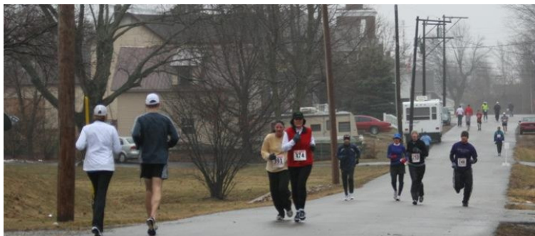
The best part of Amboy is the pancakes waiting at the finish

April is the official month of Earth Day so stay tuned for upcoming river, trail and roadside cleanup opportunities. If you are spending spring break at home and would like to help on a week-day let me know. We have many volunteers working during the week and we're also planning a river and trail cleanup in Peru on Saturday, April 9 from 1:00 - 4:30 pm, meeting at the West City Park Pavilion. Call 765 4547-2607 or runckrr@aol.com for further details or check my status on Facebook. I hope spring has finally sprung by the time you read this! See ya on the roads and trails!!