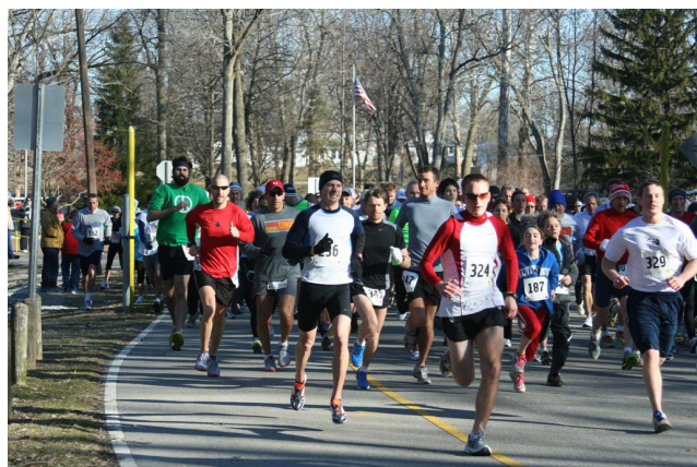
Photos from Old Ben 2011

5 The angel said to the women, "Do not be afraid, for I know that you are looking for Jesus, who was crucified. 6 He is not here; he has risen, just as he said. Come and see the place where he lay. 7 Then go quickly and tell his disciples: 'He has risen from the dead and is going ahead of you into Galilee. There you will see him.' Now I have told you."