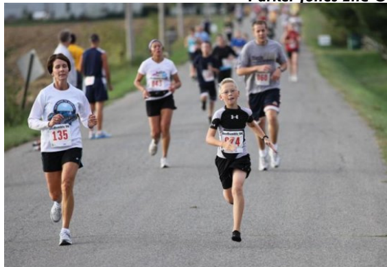
Who is that Shoeless kid?