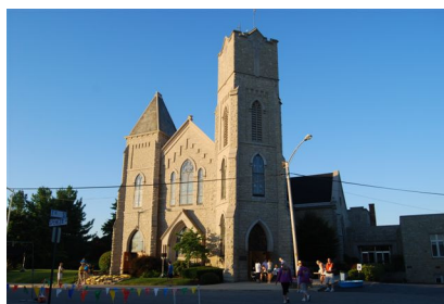
Race for Grace—Logansport