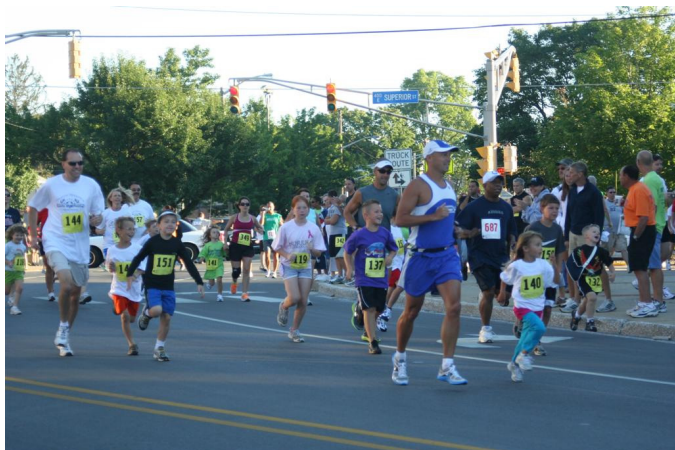
Top—Fun Run start

Old Ben race next year looking at date of March 12, 2011.